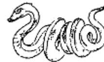
Naga The snake king. Vestige of pre-Buddhist fertility rituals and protector of the Buddha and the Dhamma.