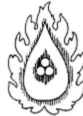
Triratana The three jewels - the Buddha, the Dhamma, and the Sangha.