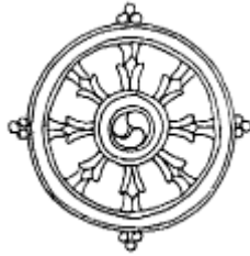
Dharmachakra The wheel of the law. The eight spokes represent the eightfold path.